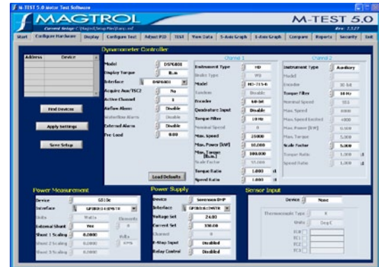
M-TEST 5.0 Hardware Configuration