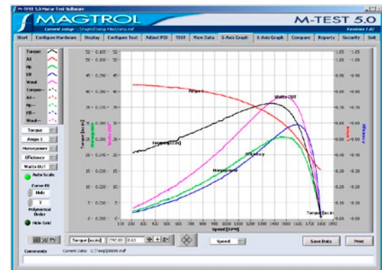
M-TEST 5.0 Graphical Data Output