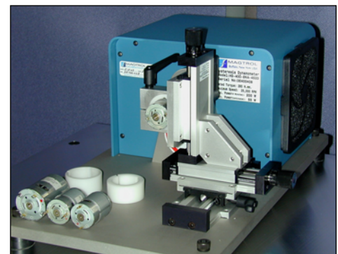
Custom motor fixture with sliding platform.