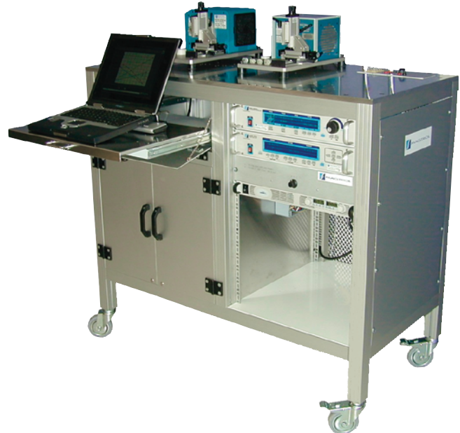
Small DC Motor CMTS featuring 2 Magtrol HD-400 Hysteresis Dynamometers with custom motor fixturing, DSP6001 Dynamometer Controller, 6510e Single-Phase Power Analyzer, FieldPoint temperature testing module and MT-TEST 4.0 Motor Testing Software.